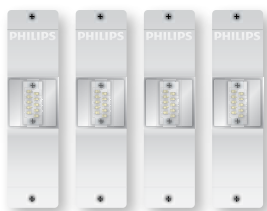
Lower Output (40 LEDs)

Approximately 50 watts power consumption.