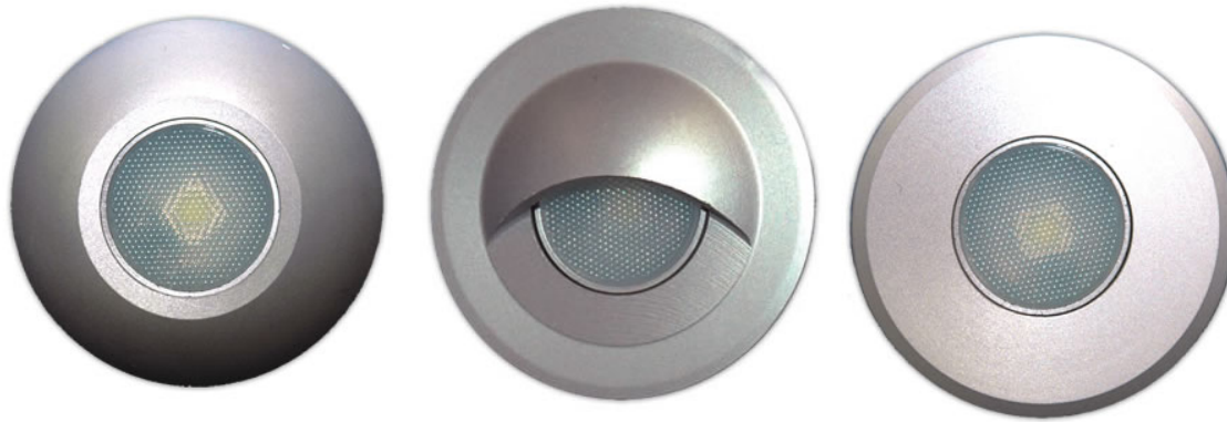
WLM2 Step Light

Bronzelite's new LED products offer the quality, innovation and performance you need to illuminate any application.