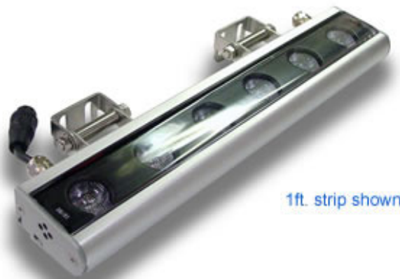
1ft. strip shown