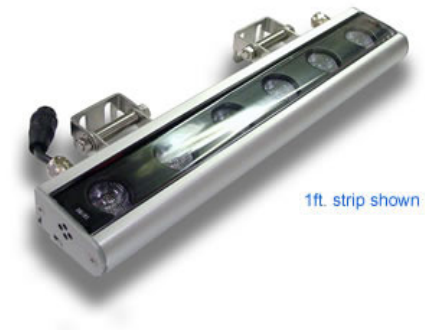
1ft. strip shown